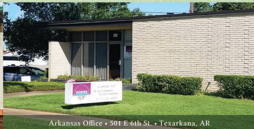
Arkansas Office • 501 E 6th St. • Texarkana, AR