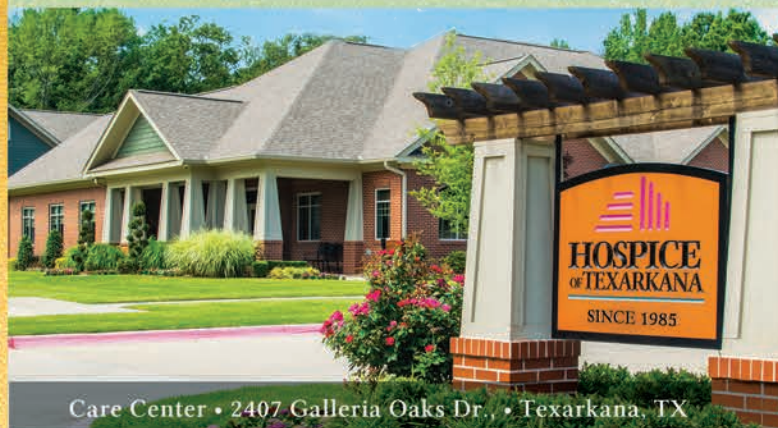
Care Center • 2407 Galleria Oaks Dr. • Texarkana, TX